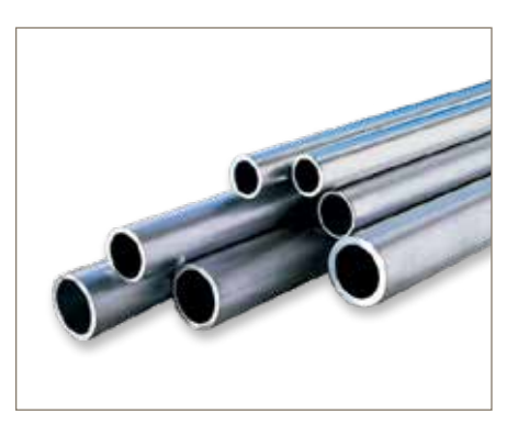
For seamless hydraulic tubes in steel and stainless steel see CAT/4041-2.