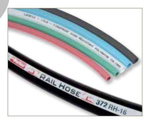
PA polyamide tubing for pneumatic applications to EN 45545-2, see document no. LEAF/0536. Pneumatic and hydraulic hoses to EN 45545-2, see document no. BUL/4480-F02.