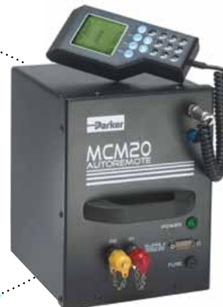
Optional Remote Handset

The comms protocol for the product is as follows: Baud rate = 9600 Data bits = 8 Parity = None Stop bits = 1 Flow control = None