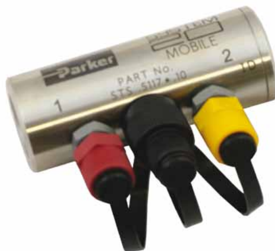
2 sizes of System20 Inline Mobile Sensors are available