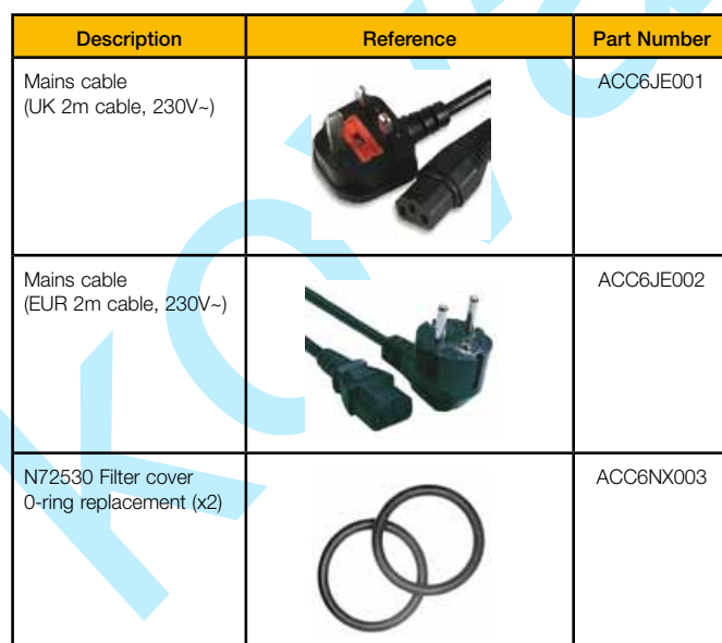
Accessory part numbers